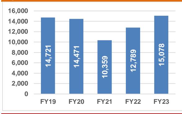
Figure 2: EBITDA & EBITDA margin trend